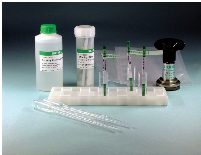
Figure 1: Test strips