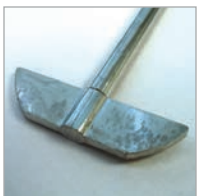
Rusted stainless steel paddle