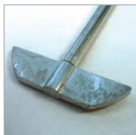
Rusted stainless steel paddle