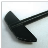
Slightly worn PTFE paddle