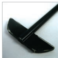
Damaged PTFE-coated paddle