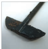
Badly damaged PTFE-coated paddle